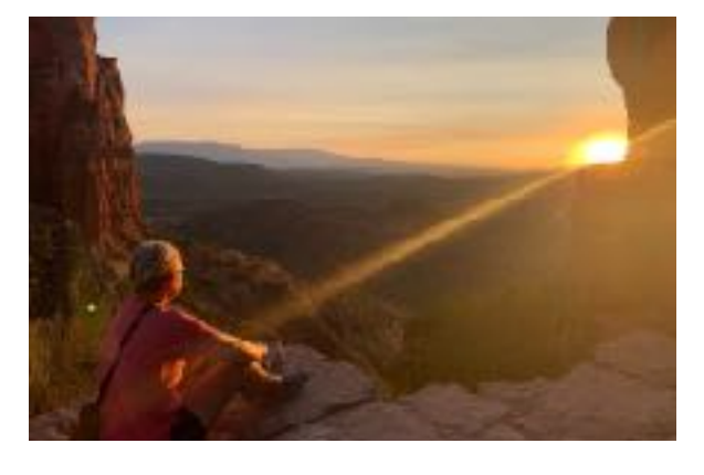
Cathedral Rock Sedona, Arizona

LUNCH BUNCH - Not sure how Lunch Bunch will work this year. Just let me know if you need extra help, and we will work it out. I've got ya!